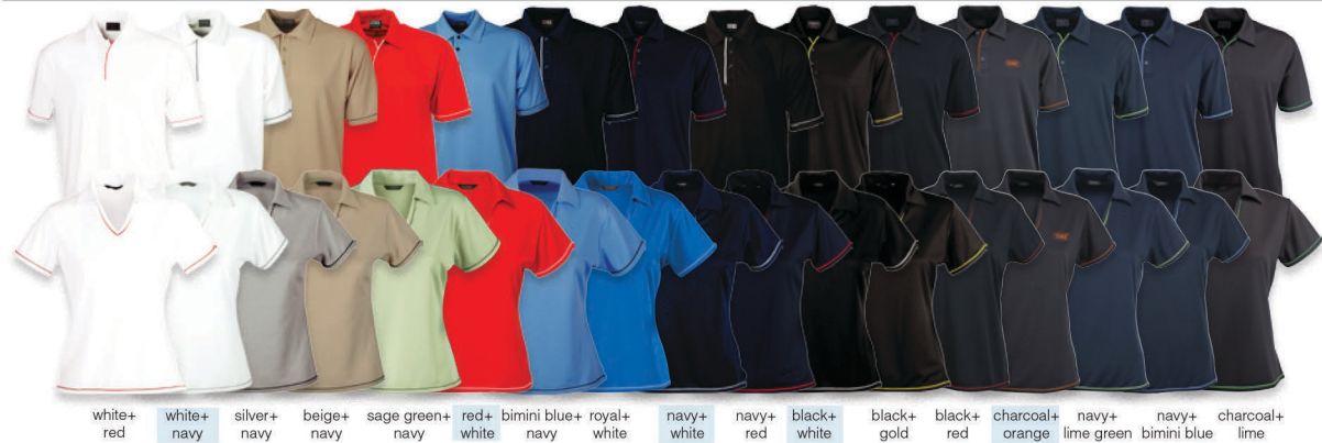
white+red white+navy silver+navy beige+navy sage green+navy red+white bimini blue+navy royal+white navy+white navy+red black+white black+gold black+red charcoal+orange navy+lime green navy+bimini blue charcoal+lime

Weights and measurements are approximate and for guidance only.